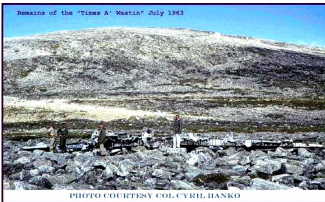
Figure A-1 Remains of the B-26 Marauder "Times A Wastin"

Today, a small United States (US) Airforce converted radar site houses a tropospheric communications link to the northernmost outposts of the hemispheric defence system. From the steep heights, US contractor maintenance personnel overlook the vast stretches of frozen tundra and infrequently visible blue-green of the Atlantic. On a flat stretch of this barren land, at the base of the steep bluff, now crowned by a radome and the concave, billboard antennas of the site, our story finds a setting. No more than 46 m (50 yards) from the present site runway, lie the weathered remains of a B-26 medium bomber of World War II vintage.